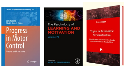
Peer-Reviewed Book Chapters